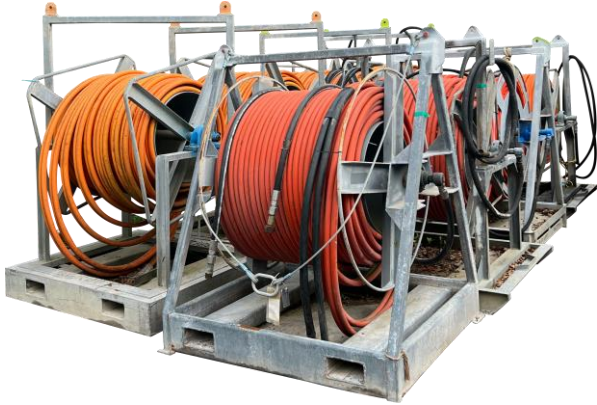
600' HYDRAULIC HOSE REELS HYDRAULIC MOTORIZED EMPTY REELS