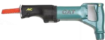
CUTS UP TO 6" DIAM STEEL 1.3HP, 46CFM, 90 PSI 0-1800 STROKES / MIN