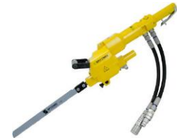
CUTS STEEL PIPE UP TO 30" O.D. 100-500 STROKES PER MIN 3.8HP, 2000PSI, 4GPM