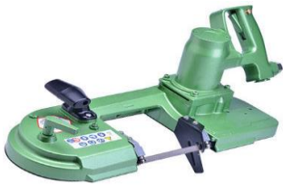
CUTS UP TO 4" O.D. .7HP, 90 PSI, 20CFM