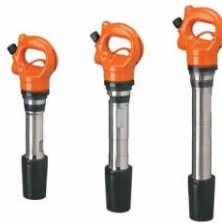
8 STROKE & 11 STROKE 37CFM, 720 BLOWS / MIN