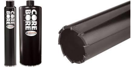
CARBIDE CORE BITS 2"-CUSTOM SIZES DIAMOND TIPPED CORE BITS CUSTOM TIPPED CORE BITS TO FIT NEED